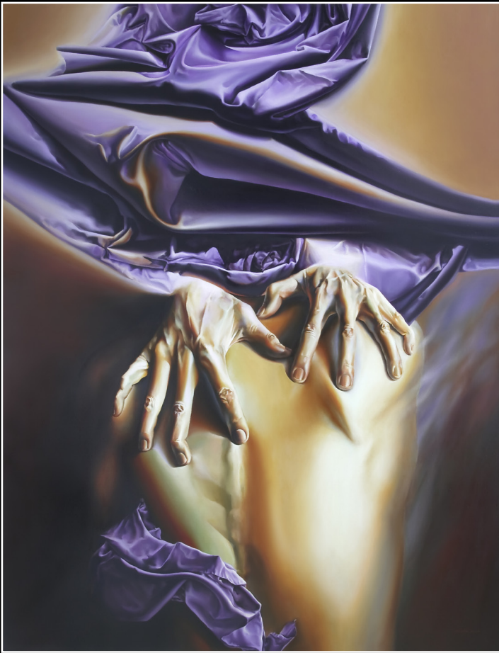
The Chosen One - Oil on canvas - 130x100