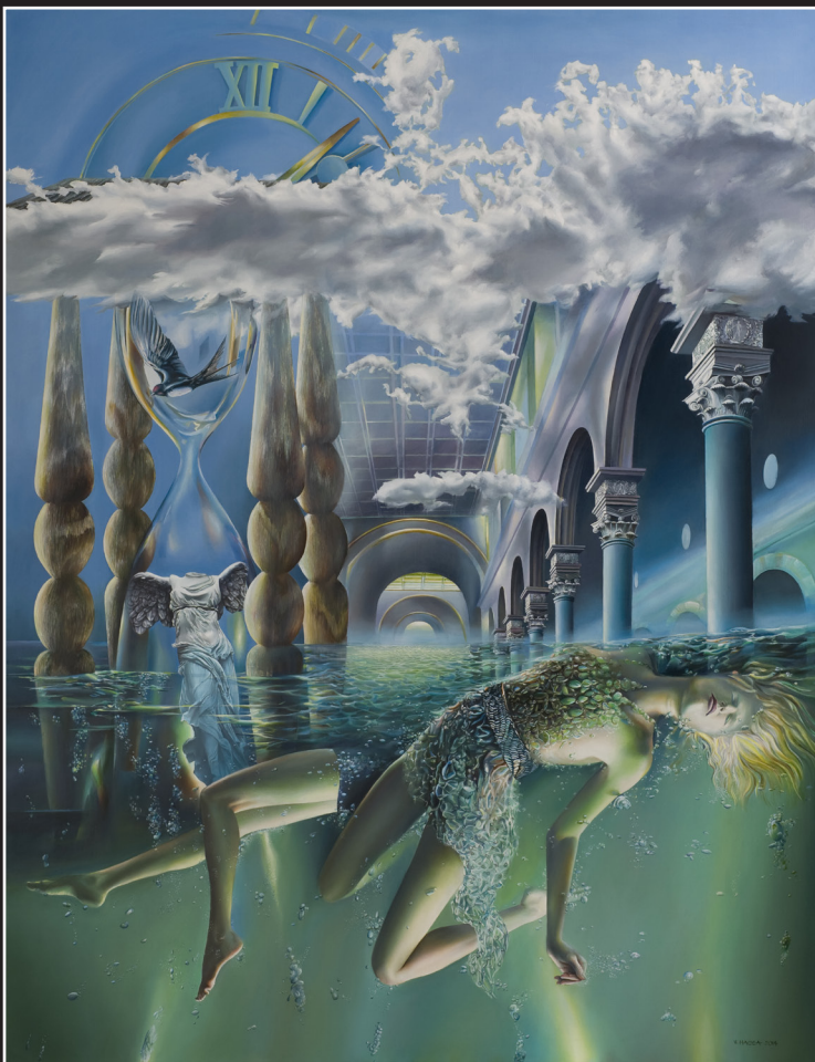
Between The Lines - Oil on canvas - 130x100