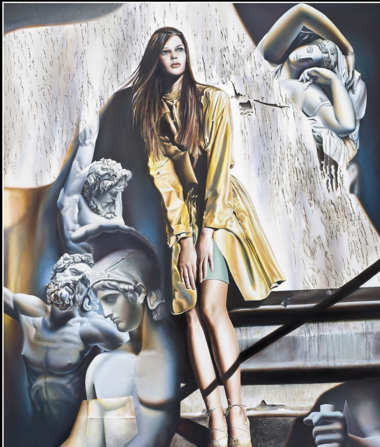
The mystery of shadows - Oil on canvas - 100x80