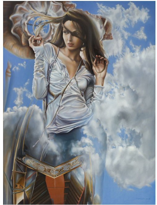
Summer Clouds - Oil on canvas - 80x60