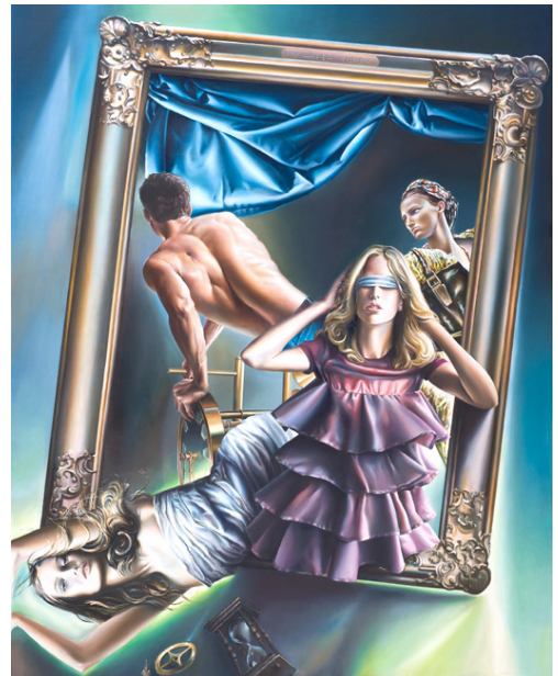
Escape - Oil on canvas - 100x80