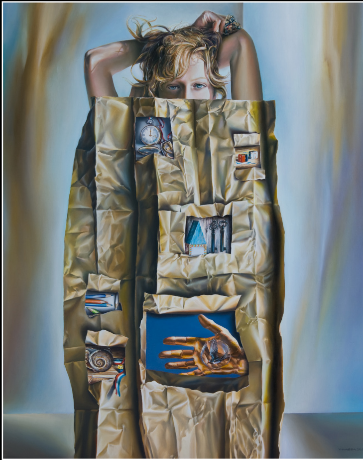
Rebus - Oil on canvas - 100x80