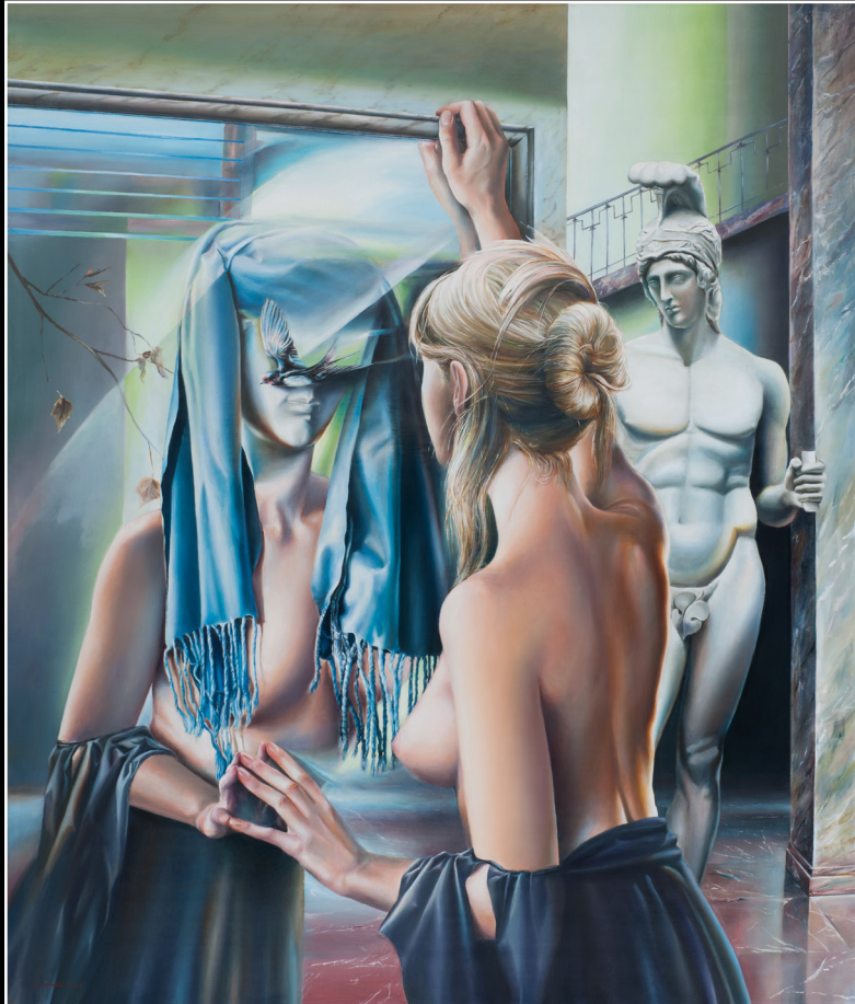
The Mirror - Oil on canvas - 90x76