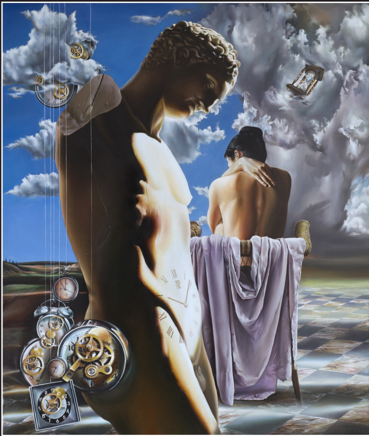
The Children Of Cronus - Oil on canvas - 100x85