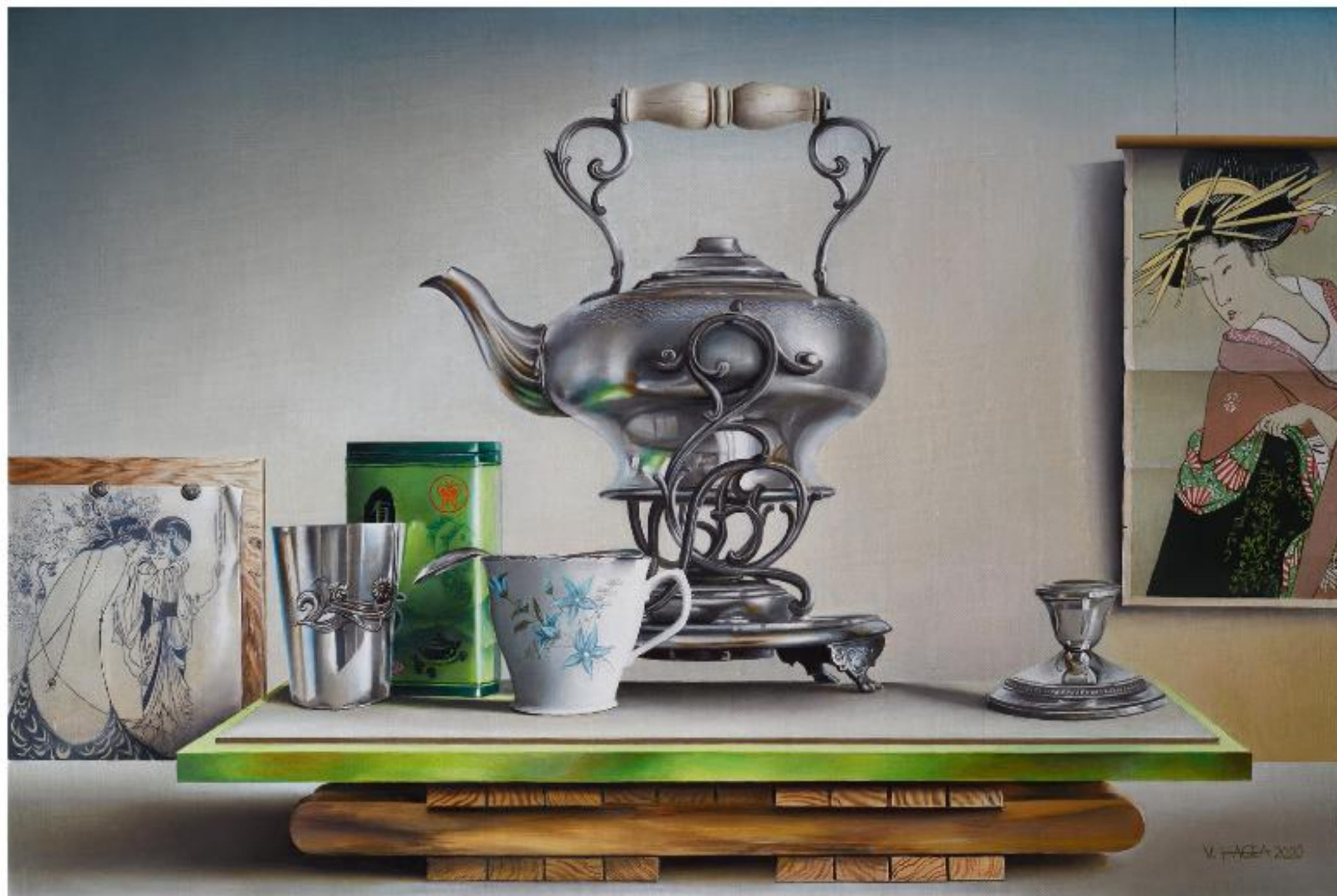
'The Memories of an Old Samovar' Oil on canvas 40 x 60 cm